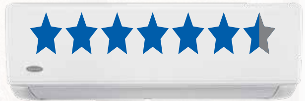
*6.5 stars rating on 2.6kW system Cooling

Whether in the bedroom, home office, study, kids room, or guest room, the Indigo series 2.6kW model boasts an impressive 6.5 ZERL star rating for cooling. This ensures excellent air conditioning, enabling your family to unwind, stay comfortably cool, and embrace energy efficiency – a true win-win!